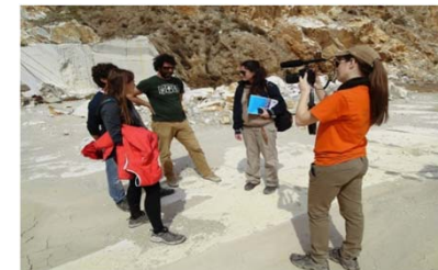
✓ Innovative educational tools