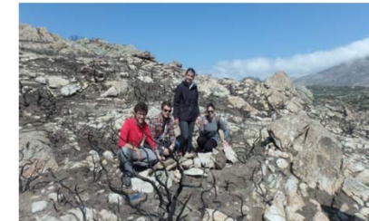
✓ Short training courses on land restoration