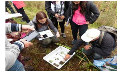
✓ Exchange of experiences and good practices