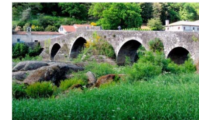
✓ EL CAMINO DE SANTIAGO Pre-conference trip (limited places)

Registration fees: 40 -70 € (limited places). FROM 11 MAY Accommodation (University Residence): 15€ per night (limited places)